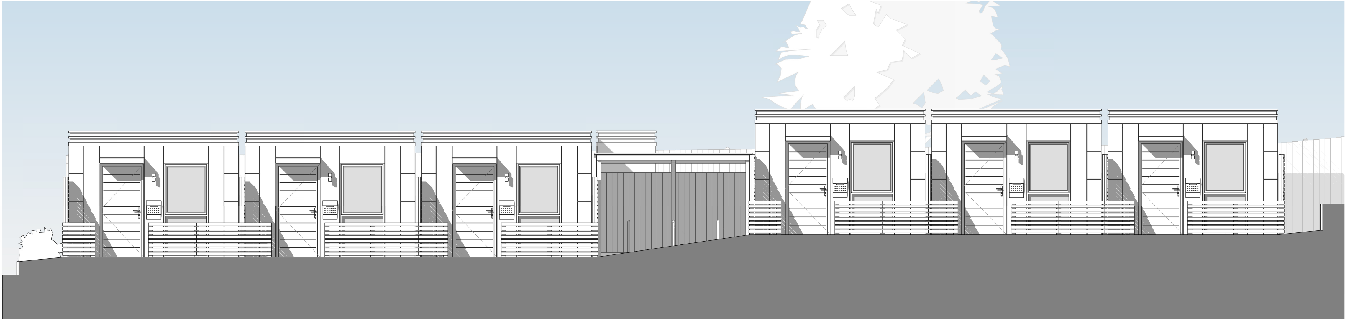
Block A & B South Elevation 1 : 50